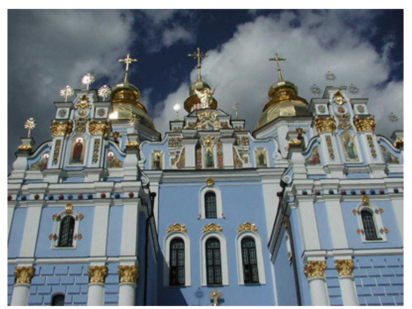
St. Michael's Monastery in Kiev

SSCU has recently made a self-assessment against the principles of the European Statistics Code of Practice. A review was made of the self-assessment and it was concluded that SSCU carried out the self-assessment in a conscientious way. The review of the self-assessment confirmed that SSCU is working in accordance with international practice. A national version of the principles of official statistics has been developed by SSCU.