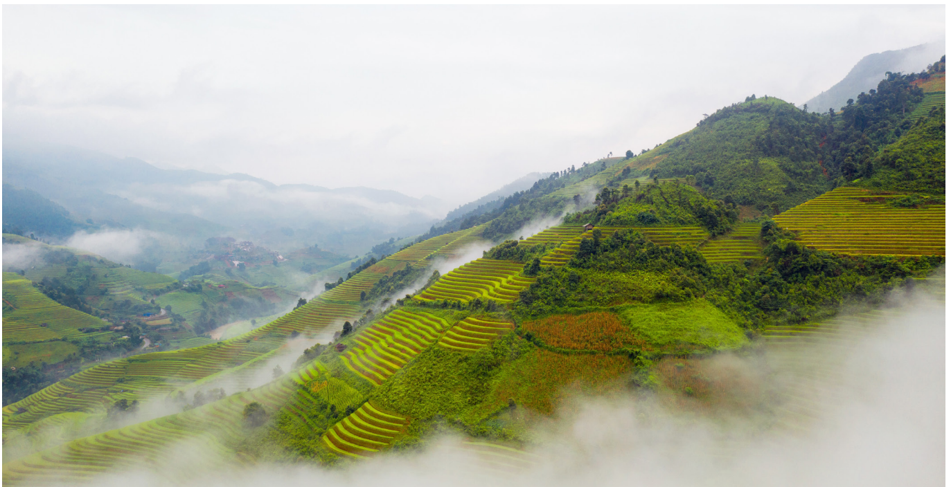
Rice fields, Vietnam

Since the project is scheduled to finish by the end of 2024, the focus for 2024 will be on finalizing the work done within the four subjects as well as designing strategies for a sustainable exit of the project. In total nine missions in Hanoi and two study visits to Statistics Denmark are scheduled to take place during 2024 ■