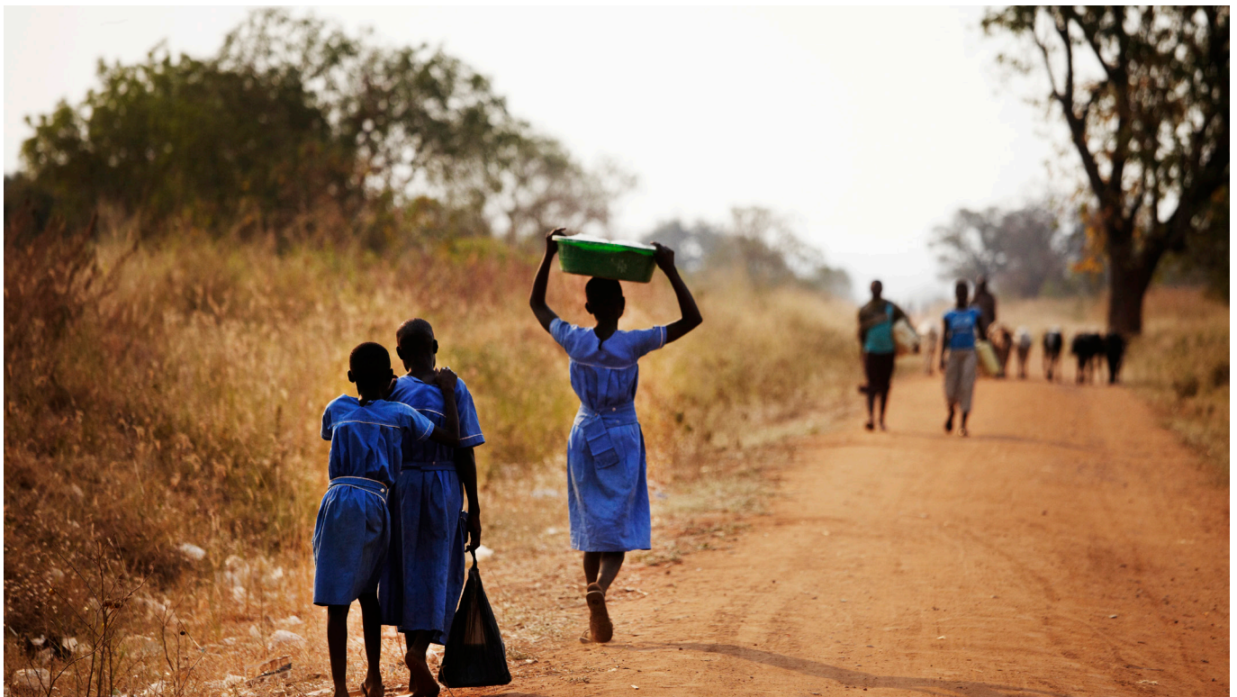
African girls in their school uniform walking on a dusty road

It is also planned that the support to the component on labour force surveys led by INSEE will continue and possibly result in a new collaboration with a fifth partner NSI. Finally, close coordination and collaboration with the other consortium partners and with other relevant stakeholders such as UN ECA and StatAfric will continue to be a focus to prevent duplication, to learn from each other, and to work together on strengthening the African statistical system ■