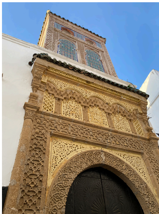
Tower in the Kasbah in Rabat, Morocco

Emphasis will therefore be put on activities already initiated such as the water account, the business register and quality management. But we will also introduce a new activity aiming at establishing an economic modelling tool similar to the Danish macro-economic model ADAM. The modelling tool will be used to predict economic development trends and calculate the effects of economic and political interventions in Morocco ■