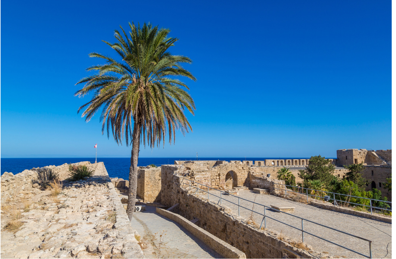
Castle ruins, Northern Cyprus