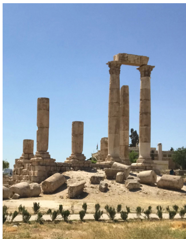
Amman Citadel, Jordan

In 2024 the project will focus on achieving tangible and sustainable mandatory operational results based on the lessons learned in 2023 in all components of the project ■