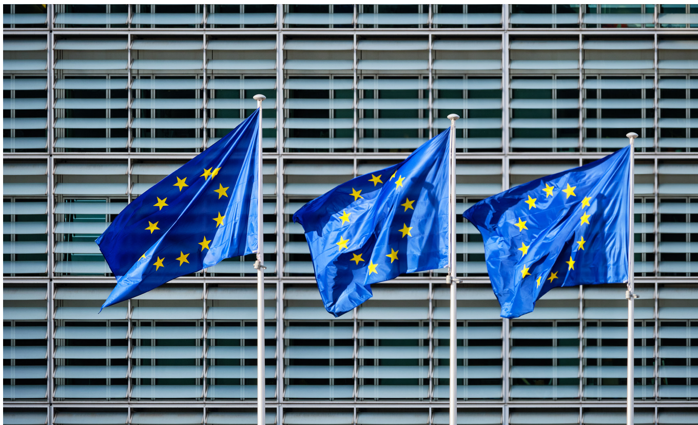
EU Commission, the Berlaymont building, Bruxelles

You can read more about the specific country projects under the twinning-modality here: