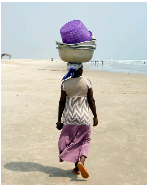
Woman on the beach, Ghana

GSS with support from experts from Statistics Denmark developed a document outlining a data quality framework aimed at ensuring uniformity in data collection methods and methodologies across Ghana.