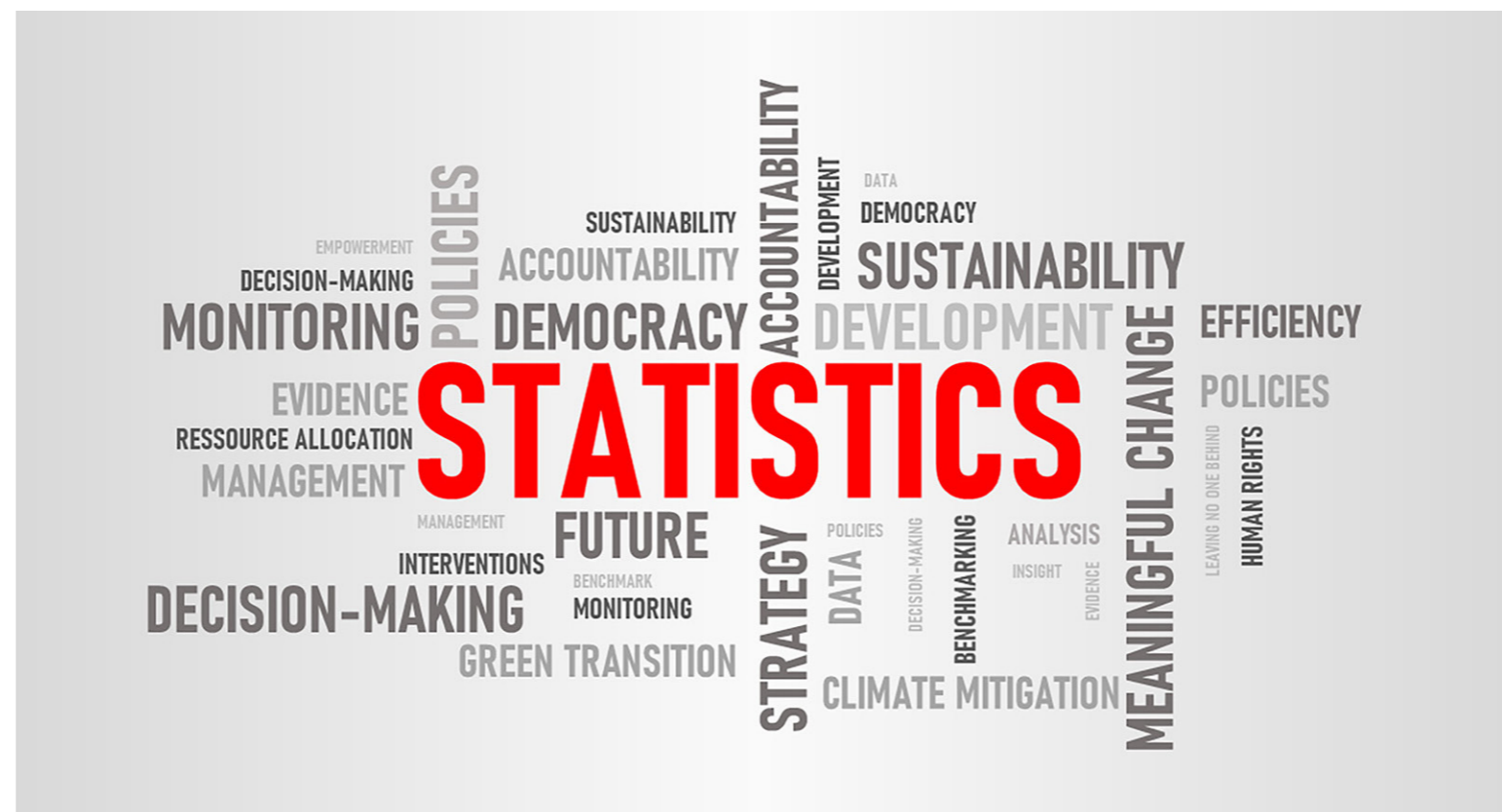
Graphics: Klaus Munch Haagenen

Statistics are indispensable in development cooperation, providing the backbone for informed policymaking, efficient resource allocation, and effective monitoring. By supporting democracy, transforming lives, promoting human rights, and safeguarding privacy, statistical data ensure that development efforts are transparent, accountable, and impactful. As societies strive for a socially just and environmentally sustainable future, the role of statistics in shaping inclusive and effective policies remains more important than ever ■