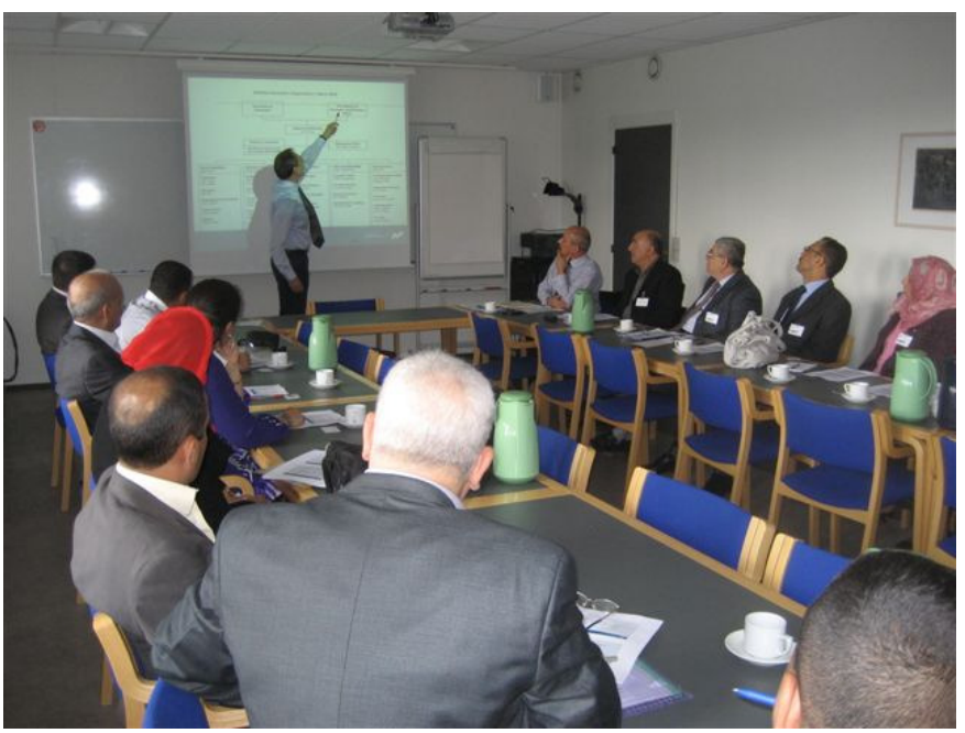
A delegation from the Ministry of Planning of Iraq learn about macro economic planning and forecasting methods.

The delegation's visit to Copenhagen and Statistics Denmark was part of a larger training programme commissioned by the Danish Ministry of Foreign Affairs with the purpose of assisting the Iraqi government in adopting better long term planning methods.